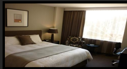
ACCOMMODATION at THE REX

Contact our events team to arrange a meeting with Gavin so we can discuss your requirements